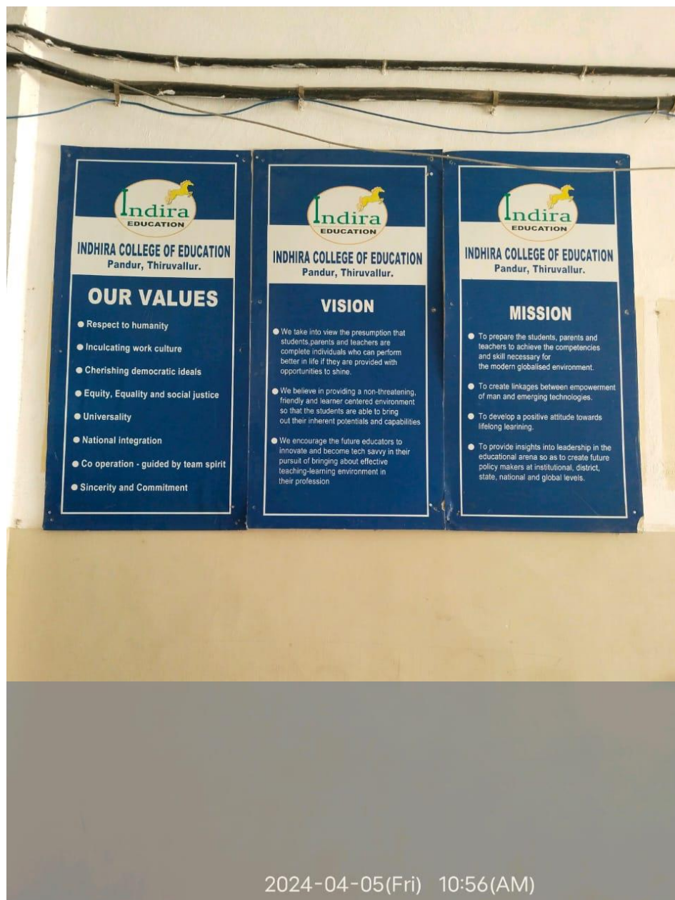
IMAGE SHOWING VISION, MISSION BOARDS