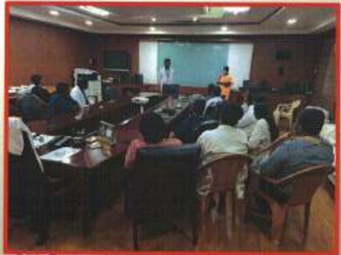
FACULTY DEVELOPMENT PROGRAMME