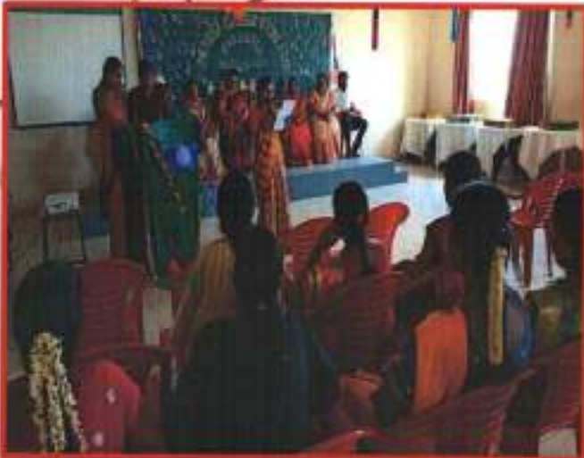
FAREWEL FOR SENIORS