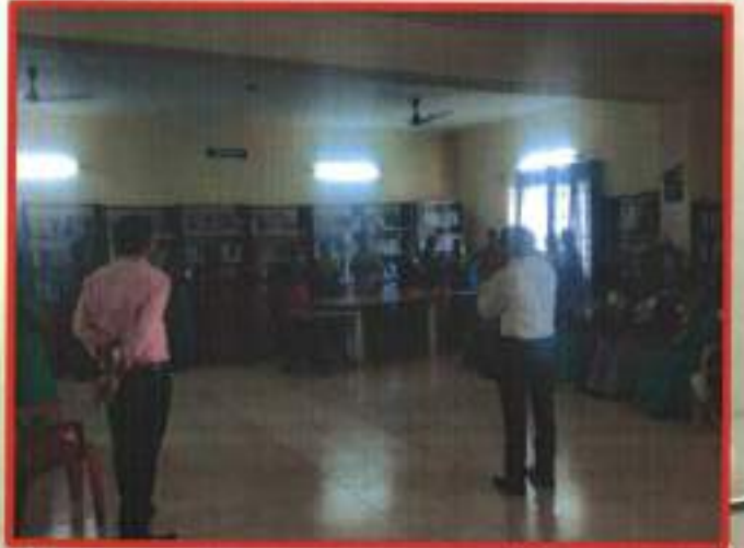
ICE BREAKING SESSION FOR FRESHERS