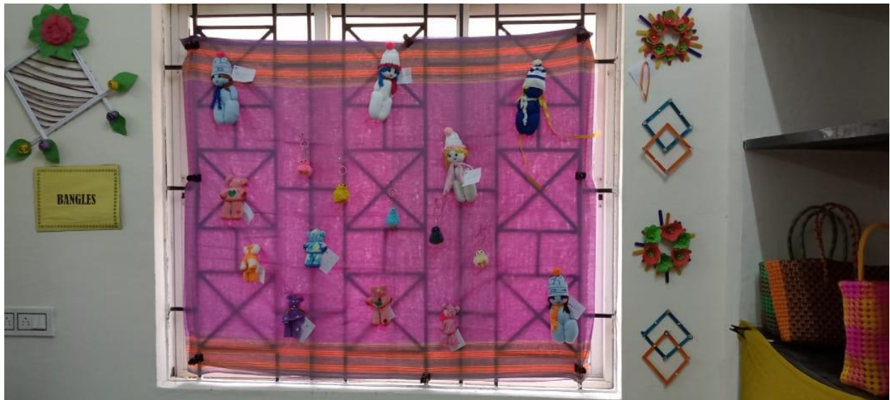
Making dolls from waste materials